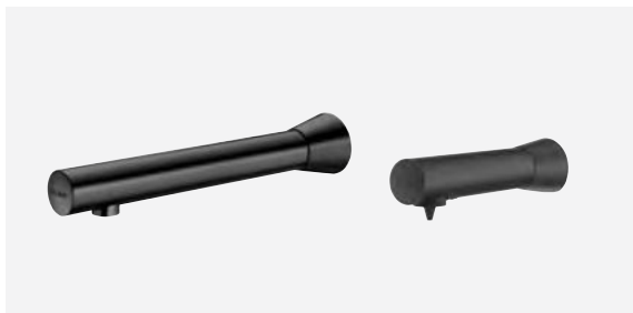
BLACK BINOPTIC 2 wall-mounted black electronic tap and BINOPTIC wall-mounted black electronic soap dispenser DELABIE references: 384130, 512051BK