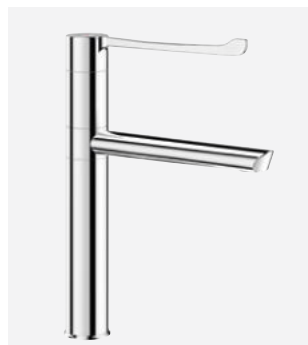
Swivelling spout H. 200 L. 200 DELABIE ref.: 2664T5