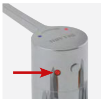
Thermal shock without removing the lever