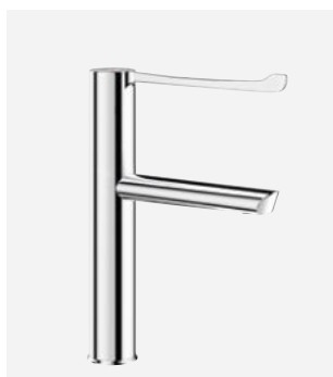
Fixed spout H. 160 L. 160 DELABIE ref.: 2665T1