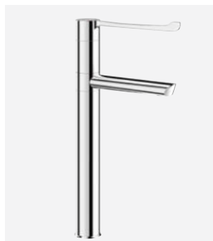
Swivelling spout H. 300 L. 160 DELABIE ref.: 2664T3