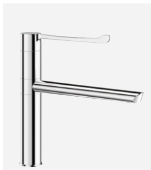
Swivelling spout H. 160 L. 250 DELABIE ref.: 2664T2

Images available on our website delabie.com , in the Press section