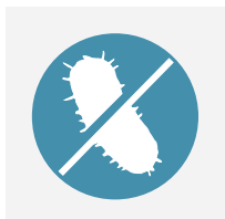
Maximum hygiene: controls biofilm