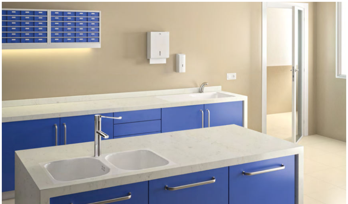
DELABIE ref.: 2664T1

Designed for healthcare facilities, DELABIE would like to present its new 2664T1 sequential mixer. It combines hygiene and safety, reduces bacterial proliferation, prevents the risk of scalding, and allows thermal shocks without shutting off the cold water. And, thanks to the sequential cartridge, it is simple to operate.