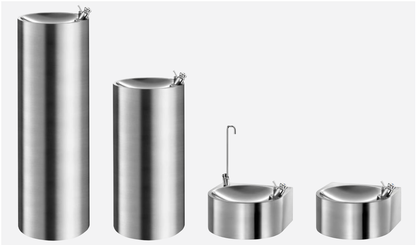
Refs. 180100, 180110, 180820, 180800