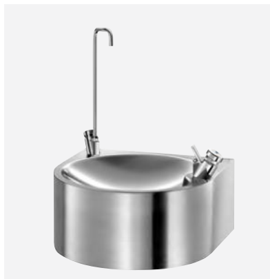
Ref. DELABIE: 180820

Images available on our website delabie.com , in the PRESS section