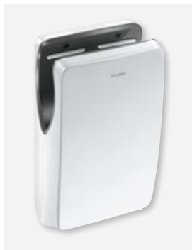
Matte white Ref. DELABIE: 510624W