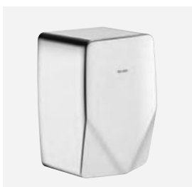
Bright polished stainless steel Ref. DELABIE: 510625P