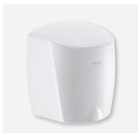
White powder-coated Ref. DELABIE: 510622W