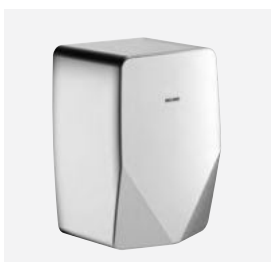
Polished satin stainless steel Ref. DELABIE: 510625S