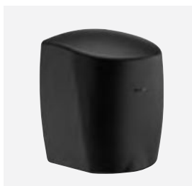
Matte black powder-coated Ref. DELABIE: 510622BK