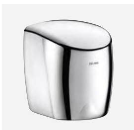
Bright polished stainless steel Ref. DELABIE: 510622