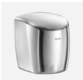
Polished satin stainless steel Ref. DELABIE: 510622S