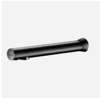
BLACK BINOPTIC TC - L. 205mm