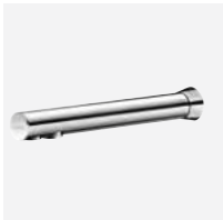
BINOPTIC TC - L. 205mm