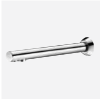
BINOPTIC long - L. 252mm

New lengths for more design possibilities!