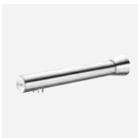
Wall-mounted chrome L. 220mm