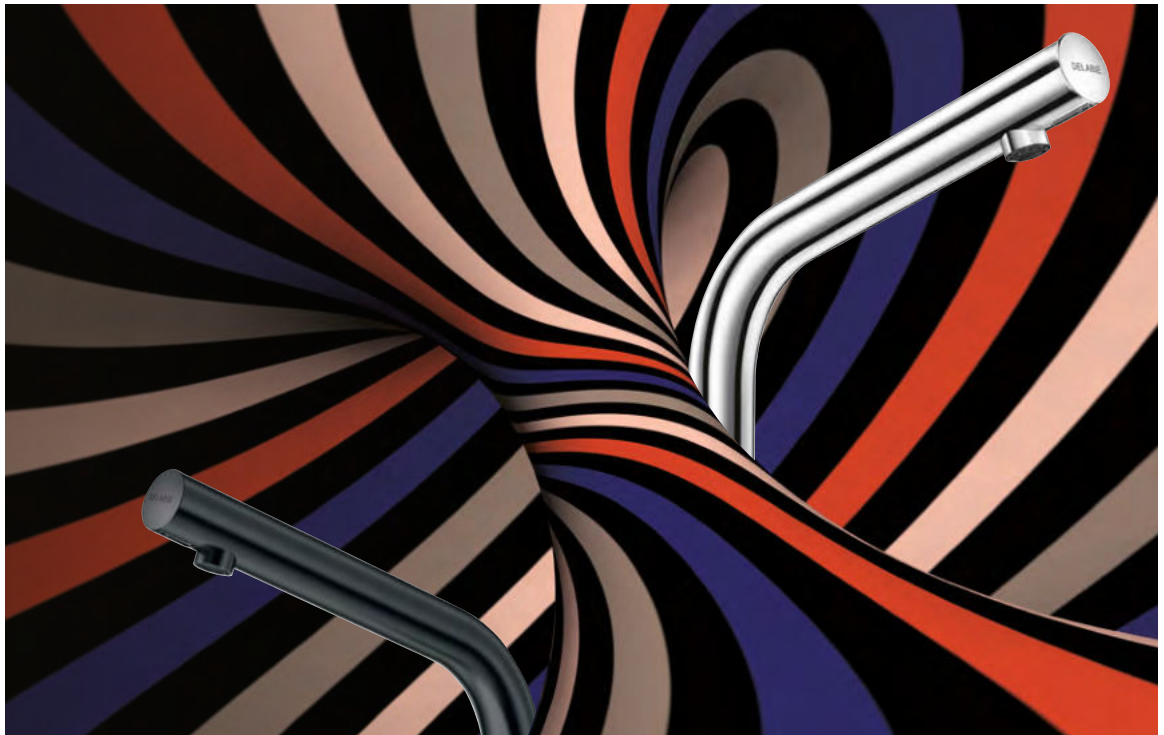
DELABIE refs.: 474 110 (chrome) and 375 130 (matte black)

DELABIE, the European leader in taps and sanitary equipment for public places, is proud to present the new BINOPTIC 2 electronic basin tap range—an innovative solution that combines performance, aesthetics, and durability to meet the evolving challenges of public and commercial washrooms.