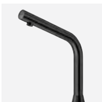
Matte black finish H. 250mm